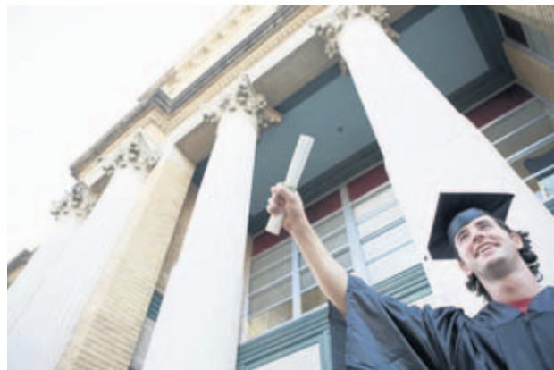
Graduates are encouraged to launch their own enterprises