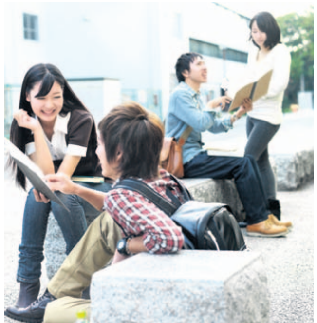
The new K+12 program aims to boost the appeal of the nation's graduates both at home and abroad

'We always say that education is a great equalizer. This universal kindergarten program will do just that as it democratizes access to pre-school education'