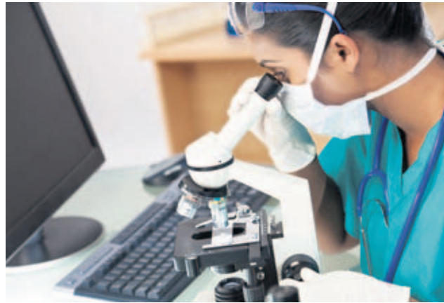
Participation in higher education in Indonesia is rising and projected to reach 25% of the population by 2014

According to Deputy Minister for Education, Dr. Fasli Jalal, countries such as China and Australia are popular locations for study, whereas students going to the U.S. have almost halved due to more stringent visa restrictions following 9/11 and rising costs.