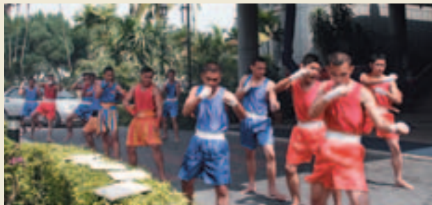
UPNM combines academic excellence with the pursuit of military capabilities

Lt. Gen. Ismail stresses that, just like other higher learning in-