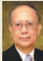
SYED ARABI IDID Rector of IIUM

ments. It also has more than 300 foreign lecturers from over 50 countries, one of the highest percentages of international students in the world, and—unusually for an Islamic educational institution—more female students than male. The emphasis, says the Rector, is on moderation and optimism.