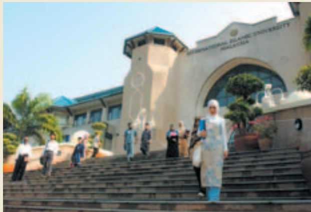
IIUM seeks to integrate high quality education with Islamic values.

The International Islamic University of Malaysia (IIUM) is gaining global academic distinction for its unique model of integrated education