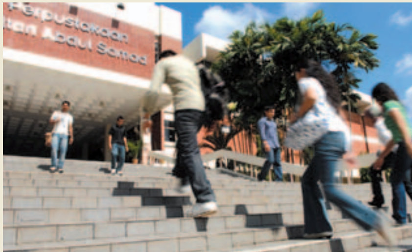
Students entering the Perpustakaan Sultan Abdul Samad library at Universiti Putra Malaysia in central Peninsular Malaysia.

Ultimately, Malaysian researchers and graduates are expected to be at the forefront of new technologies and to contribute towards the country's socioeconomic progress. "We hope that our people can acquire the knowledge and the necessary skills through our